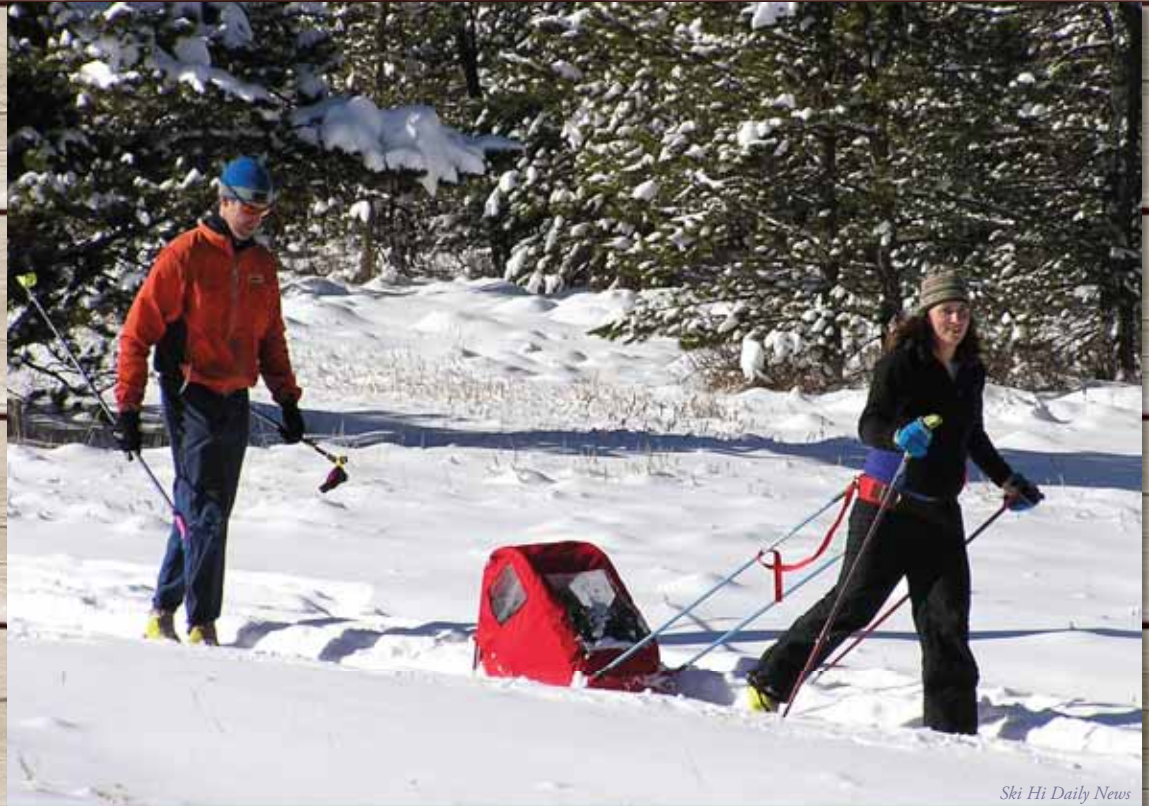
Ski Hi Daily News